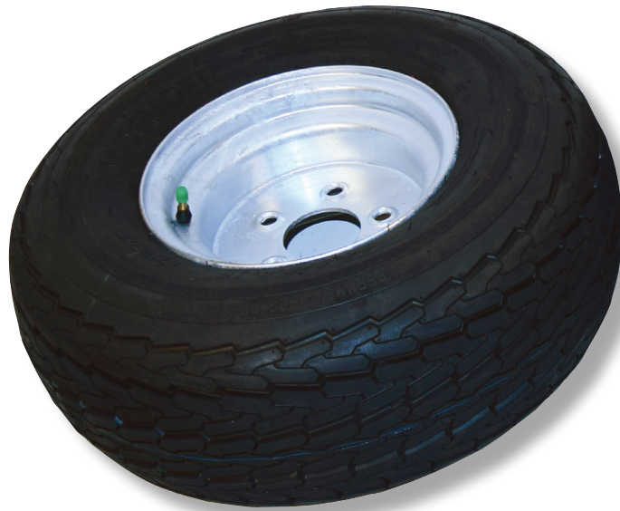
Full Size Spare Tire (1)